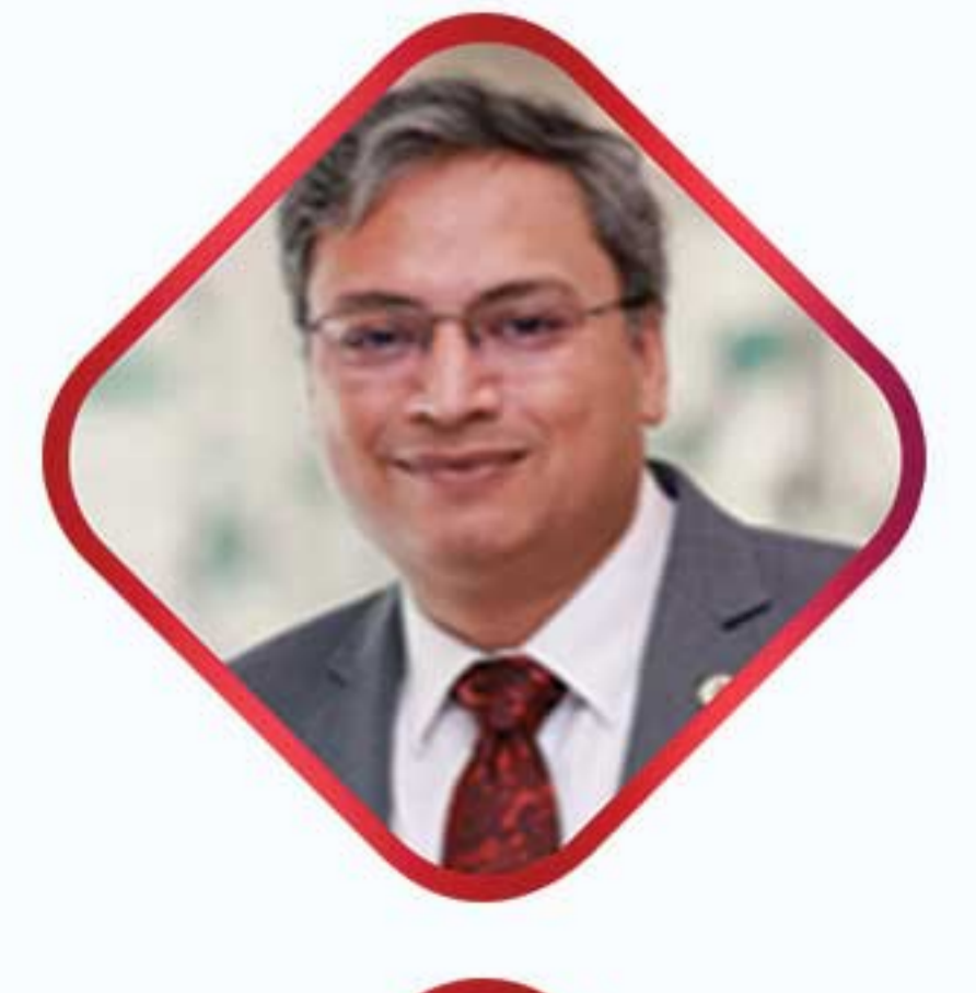
Dr. Amit Gupta Centre For Diabetes Care, Greater Noida.