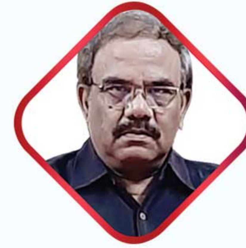
Dr. Sai Kundala Diabetic Care Hospital, Rajahmundry.