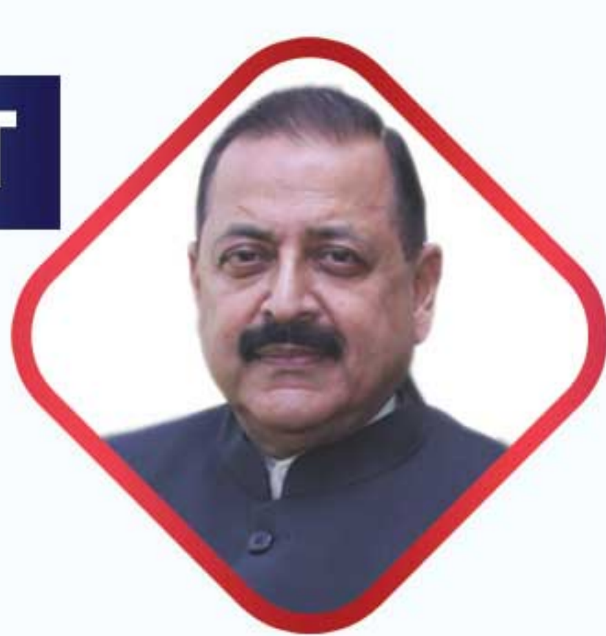
Dr. Jitendra Singh,

Honorable Union Minister of State (Independent Charge) of the Ministry of Science and Technology & Ministry of Earth Sciences, Minister of State in the Prime Minister's Office, Minister of State in the Ministry of Personnel, Public Grievances and Pensions, Department of Atomic Energy and Department of Space, Government of India, New Delhi, India.