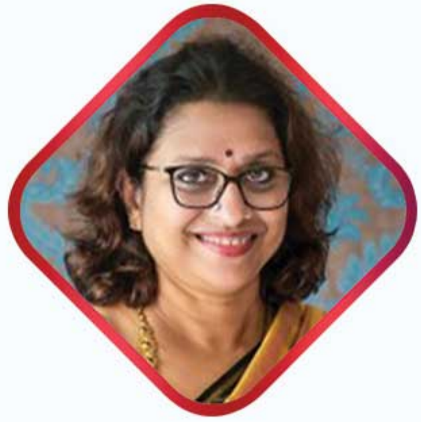
Dr. Uma Ram Seethapathy Clinic & Hospital, Chennai.